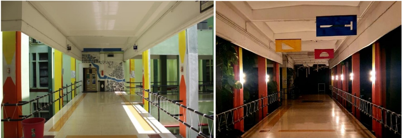
Block decoration done by students on regards of the Department fest i.e. 12-03-2022 @ School of Architecture

“We are what we see. We are the Products of our Surroundings. –Amber Valletta. At every step in our life, Surroundings generate a profound impression on our Character and Thoughts. A Creative Environment requires a Colorful, Brightful and Dynamic Character. Keeping this in Mind, Students of Architecture had Designed their own Environment and Executed the Design by themselves. They created an environment both Lively and Diverse, Dynamic and Rigid. Students formed in to various groups and worked with different Materials such as Metal, Bamboo, Plastic, Paper, etc. to create beautiful Decorative Elements of Architectural Value. They have experimented with Paints, Ropes, Electric Cables and Bulbs to enhance the value of their School Environment. These Decorative elements are connected to courses they have studied as part of their Academics in an Abstract manner.