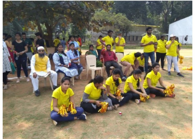
Intra department annual sports day conducted successfully on 11-03-2022 @ Ground - KL University

Students of the Schools were divided in to Four Houses represented by Four Colors – Red, Blue, Green & Yellow. These houses competed with each other in various Sports conducted as part of Annual School Sports Competition. Each of these groups had both Faculty and Students as members. This encouraged and lifted the Spirit of Competitiveness among the Members. Sports such as Tug of War, Cricket, Badminton and Futsal were played by the Students with great Excitement and Energy.