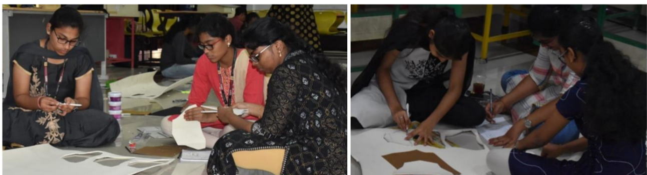
Students working on their models for Do-D-Dupe competition on 12-03-2020 @E108 - School of Architecture

Do-D-Dupe is a PROP DESIGN Workshop aimed to extract Creative Ideas from the participants and assist them in bringing their Prop Design Ideas into Physical Form. Students from various Architectural Institutions have participated in the Workshop and Created PROPS very beautifully. Participants were given required Materials and Assistance to experiment with Designs and Create reasonably Good PROPS.