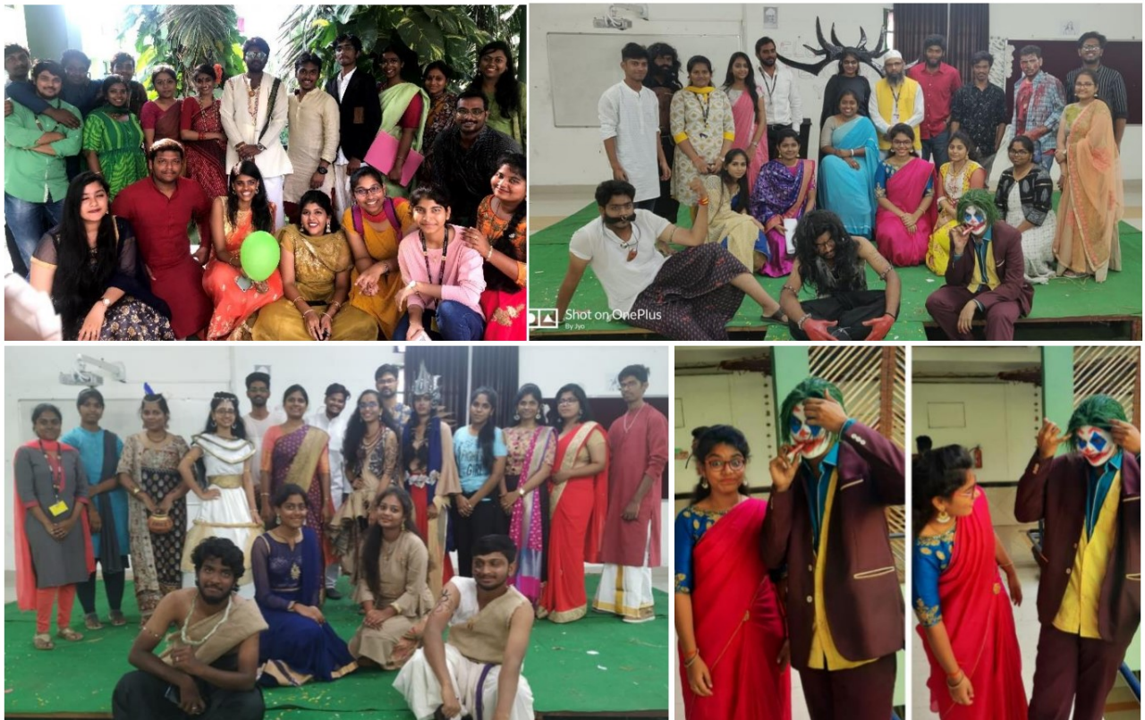
Students participating with various costumes for pre fest event @E210 - School of Architecture

This day was celebrated with Ethnic Wear by all Students, Costume Fashion Walks, and other Cultural Programs. All Students came wearing some kind of Ethnic wear which represents diverse cultures of India. There were Skits, Singing and Dance performances by the Students. Most importantly the Fashion Walks by Student Houses were very beautiful. Each house has selected a Subject and Theme to represent through Costumes and Fashion Walk. It was a Final and Fun day filled with Joy and Happiness.