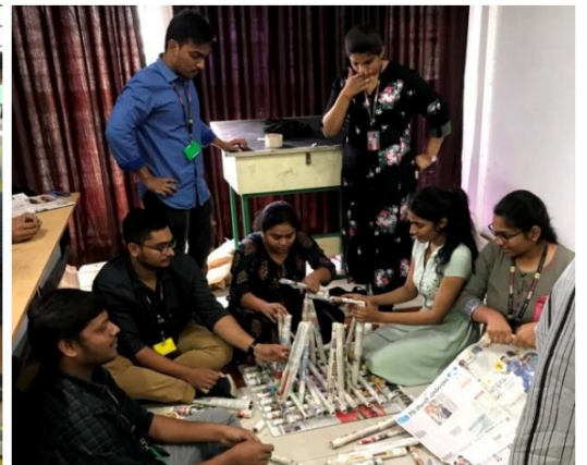
On the spot competitions conducted on 1st day i.e. 12-03-2022 @ School of Architecture